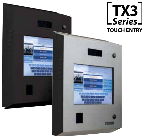
[TX3 Series] TOUCH ENTRY